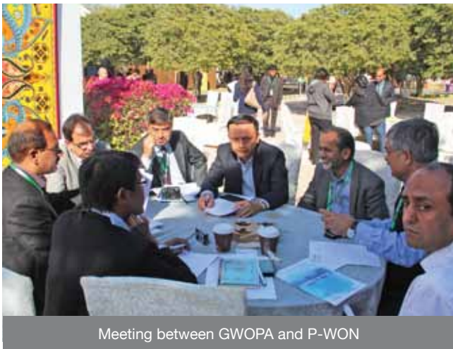
Meeting between GWOPA and P-WON