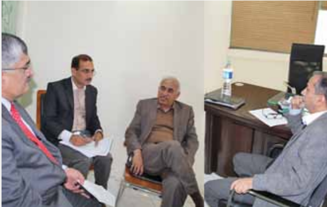
P-WON Partners' Meeting

The partners' 2nd meeting on P-WON was held on December 19, 2013 in the office of The Urban Unit, Lahore. This meeting was arranged as a