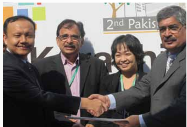
Chairman P-WON and Partnership head PERPAMSI signing the MOU

A side meeting was held on the third day of 2 nd Pakistan Urban Forum, a major conference on South Asian Cities that proceeded from